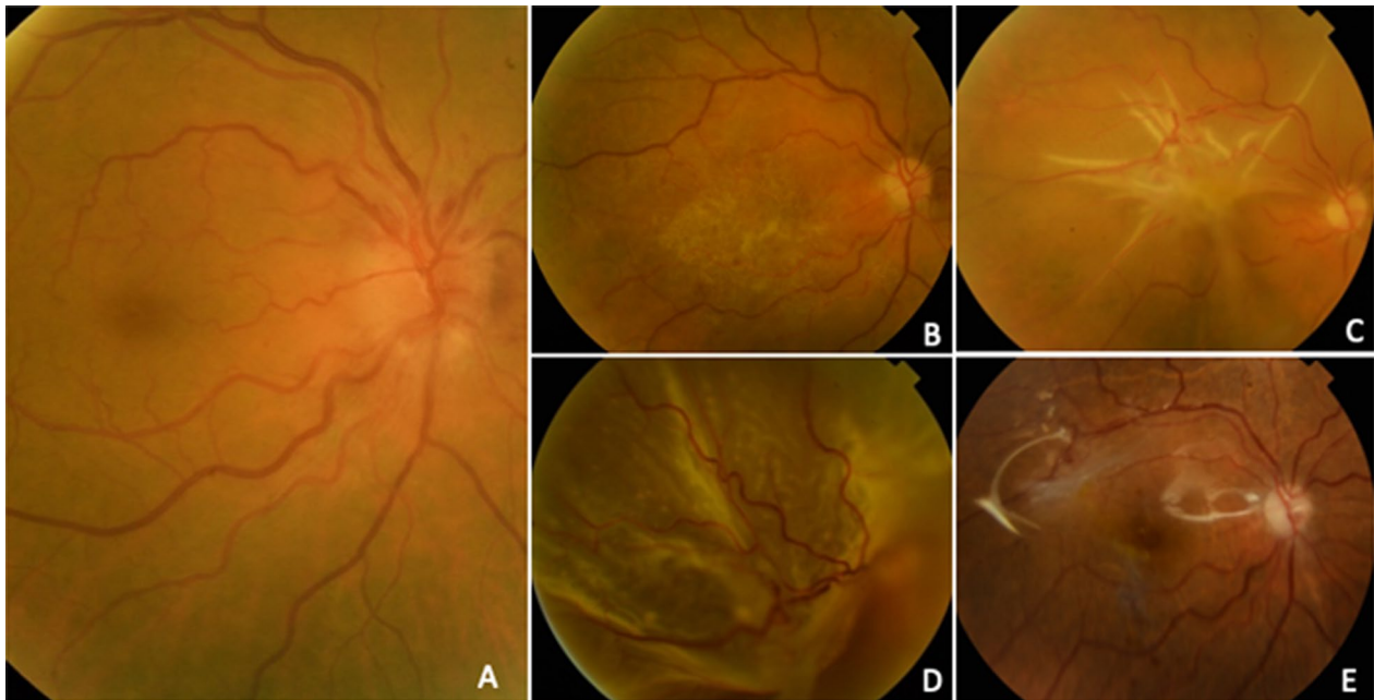
Fig. 3 The epiretinal membrane (ERM) in patient 3. A Pretreatment; B ERM at 1 month; C ERM at 3 months; D appearance of retinal detachment preoperatively; and E postoperatively

improvement is not unusual and recovery of at least three lines of Snellen vision has been reported in up to 40% of patients, although there is some controversy regarding this improvement, as discussed below.