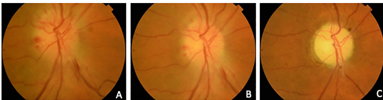
Fig. 1 Evolution of the optic nerve head appearance during the follow-up. A Optic nerve aspect at baseline; B 1 month; and C 3 months after the acute event