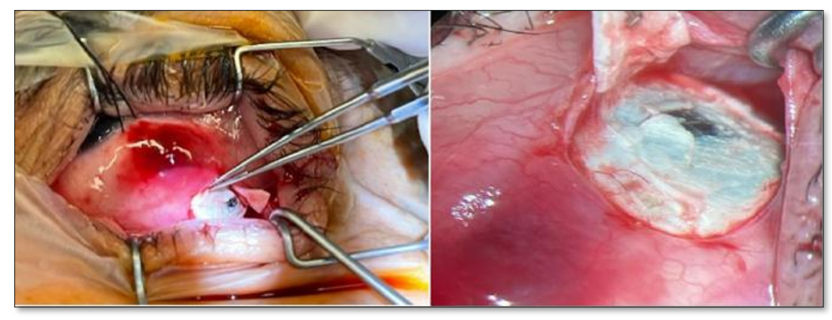
Figure 2. Modified suprachoroidal implantation technique: After the first scleral fleb, a second scleral fleb smaller than the first one (2x2 mm) was created in the scleral bed.

Subtenon implantation: A small cut 10 mm away from the limbus was made through the conjunctiva and tenon capsule in the infero-temporal quadrant. A curved subtenon cannula attached to the syringe containing stem cells was inserted through the cut, and forwarded into the extraocular muscle conus. Stem cells was then injected through the cannula and insertion site was pressed with a sponge to prevent the leakage. Subsequently, the conjunctiva and tenon were sutured with an 8/0 vicryl suture (Figure 3).